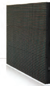
LED sign modules

CLIENT/PROJECT: College of Wooster Master Campus Sign Plan